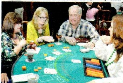
Casino games and Texas Hold 'em were part of the Mardi Gras gala, held at Mountain Valley Country Club. Throughout the past seven years, the Athenas have donated more than $250,000 to charities that benefit Johnson County residents.